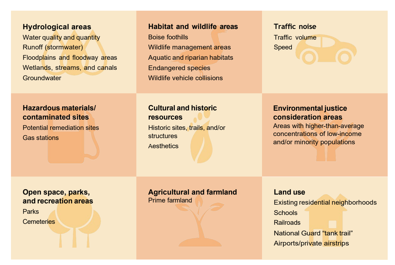
Figure 1. Environmental issues included in analysis

COMPASS has collaborated with environmental and natural resource agencies and organizations and other stakeholders through its Environmental Review Workgroup since 2008 to address environmental issues relevant to long-range transportation planning. Early in the development of CIM 2050, COMPASS worked with the Environmental Review Workgroup to identify environmental values and help develop plan goals. Details about the workgroup's earlier activities can be found in the <u>COMPASS Environmental Review Process</u>, 2008–2013<sup>2</sup> and <u>COMPASS Environmental Review Process</u>, 2014-2022<sup>3</sup>.